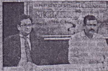
Dignitaries during expert lecture.