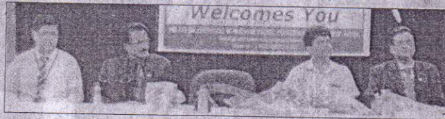
Guests at the recruitment drive.