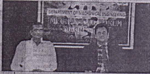
Dignitaries seated on the dais.