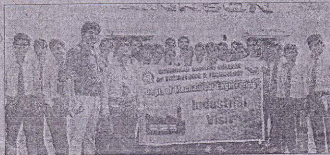
Students during the industrial visit.