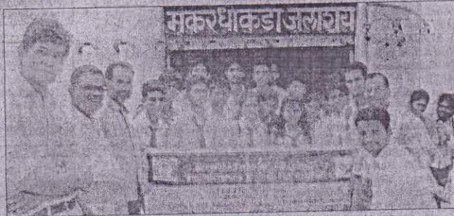
Students and teachers at the industrial visit.