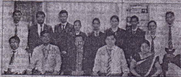
Students who got recruited along with the faculty.