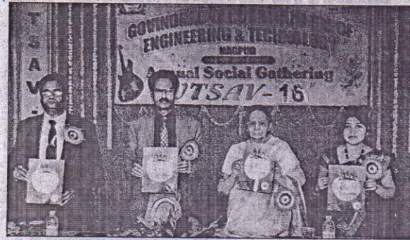
Dignitaries at social gathering 'Utsav-16'

SUNDAY TIMES OF INDIA, NAGPUR FEBRUARY 28, 2016