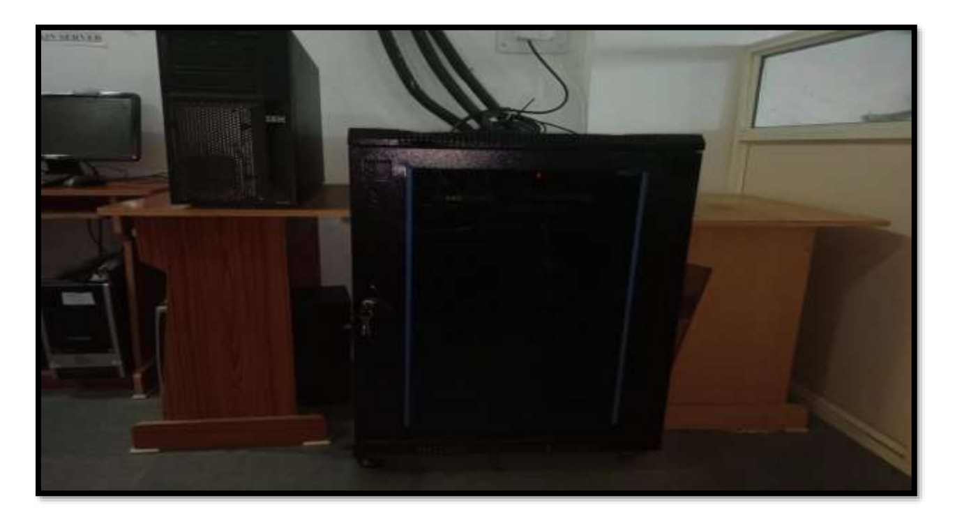
INTERNATE AND WI-FI SERVER