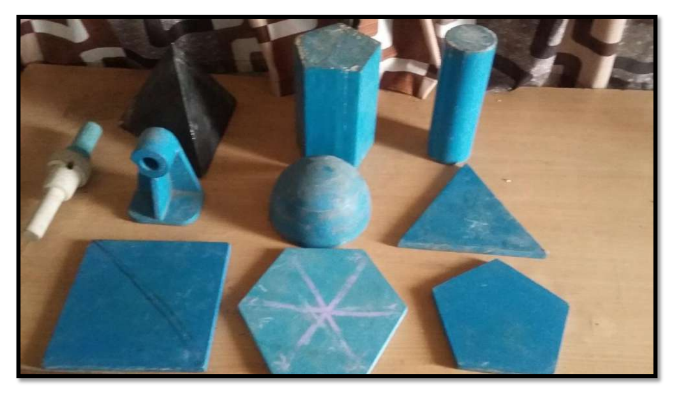
ENGINEERING DRAWING TOOLS