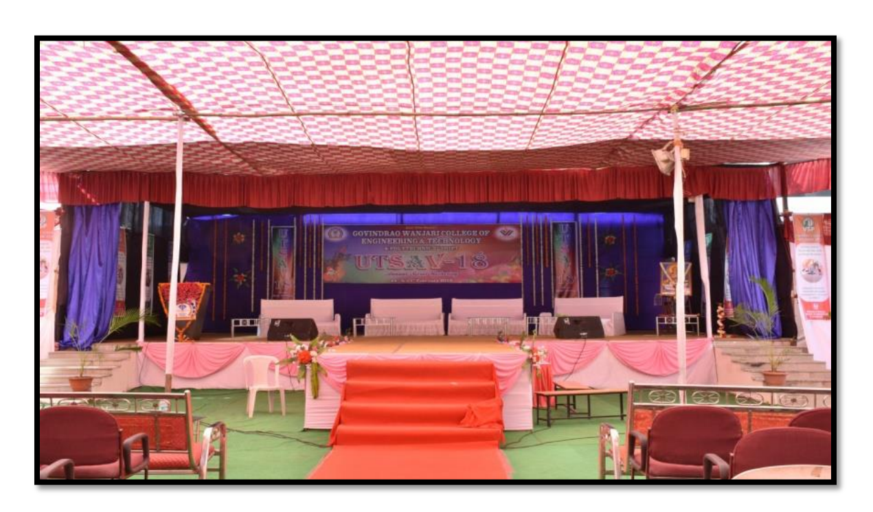
Open Air Stage for Cultural Programs