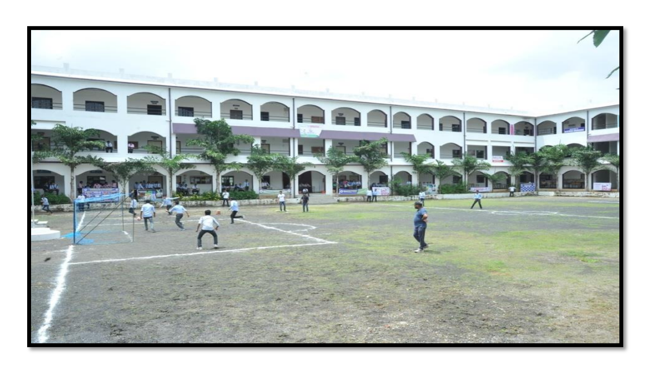
Inside the college Playground