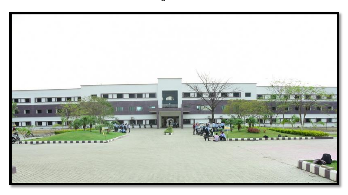
Inside the college