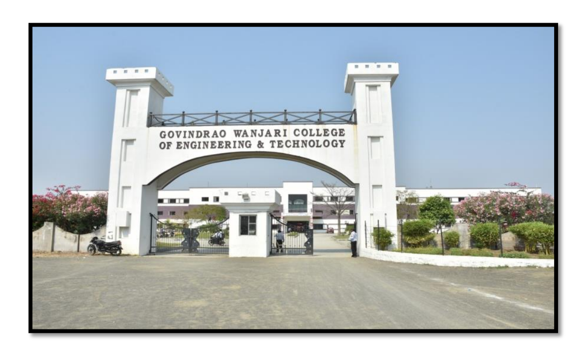
College Front View