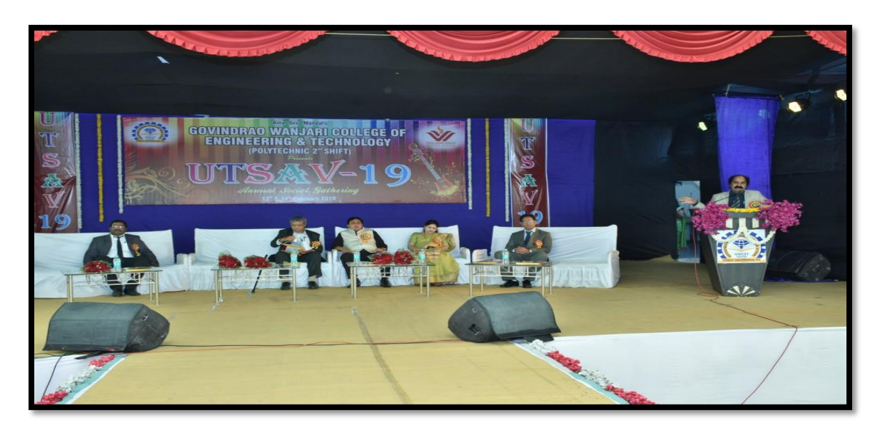
Open Air Stage for Cultural Programs