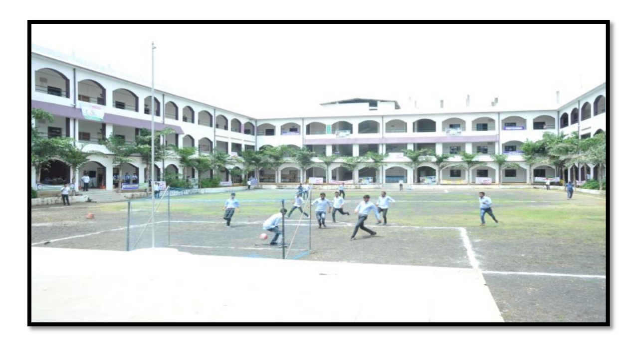
Inside the college Playground